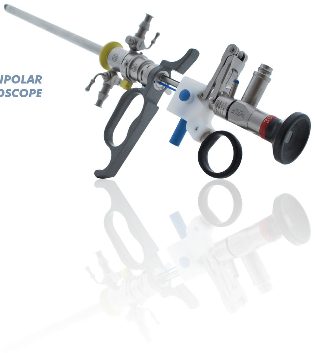
STEMA BIPOLAR RESECTOSCOPE